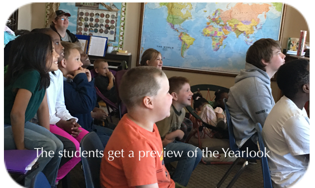
The students get a preview of the Yearbook